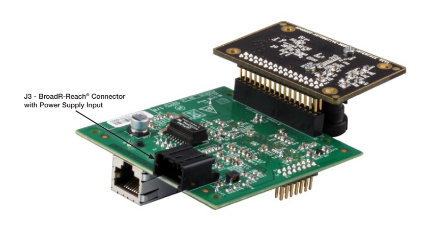
Figure 2: Qorivva MPC5604E Kit (bottom angle)