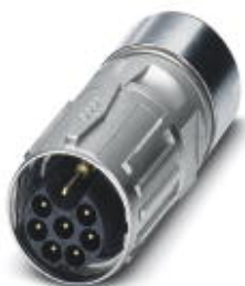
Cable connector, straight, SPEEDCON locking, M17, Number of positions: 5+3+PE, Type of contact: Pin, Crimp connection, shielded: yes, Cable diameter: 5 mm...9.2 mm

Please be informed that the data shown in this PDF Document is generated from our Online Catalog. Please find the complete data in the user's documentation. Our General Terms of Use for Downloads are valid ( http://phoenixcontact.com/download )