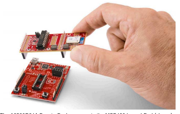
The A2530R24A BoosterPack snaps onto the MSP430 LaunchPad (shown) or the Tiva C LaunchPad (each sold separately).

The A2530R24A-LPZ BoosterPack kit eases the implementation of wireless for a wide range of applications, including: ZigBee Light Link control systems, Home/building automation, lighting systems, low power wireless sensor networks, consumer electronics, industrial control, monitoring, among many others.